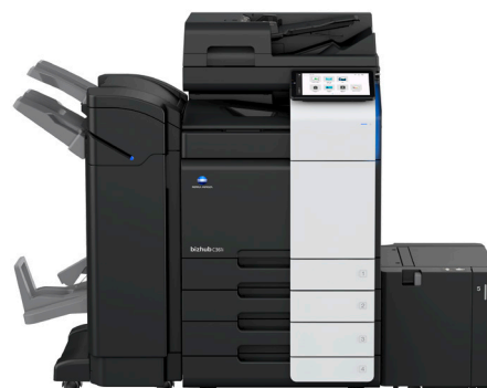
bizhub i-Series C361i