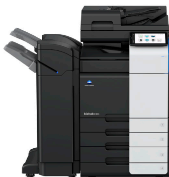
bizhub i-Series C301i