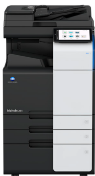
bizhub i-Series C251i