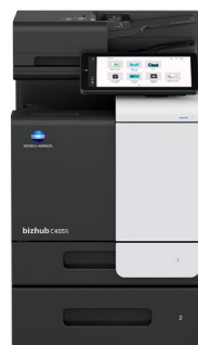
bizhub i-Series C4051i