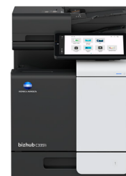
bizhub i-Series C3351i